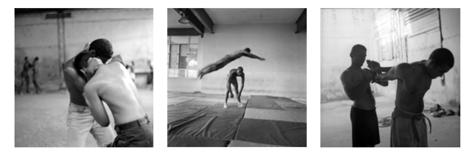
To be "in the struggle" is, in Cuban popular culture, to find oneself struggling for economic survival, for securing one's subsistence. ANTONIO JOSÉ PONTE